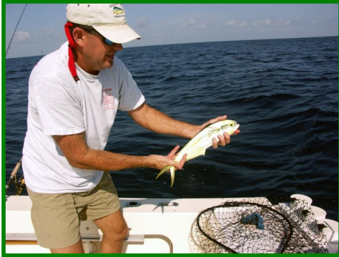
Young-of-the-year dolphin make up more than 99 percent of the fish tagged each year.