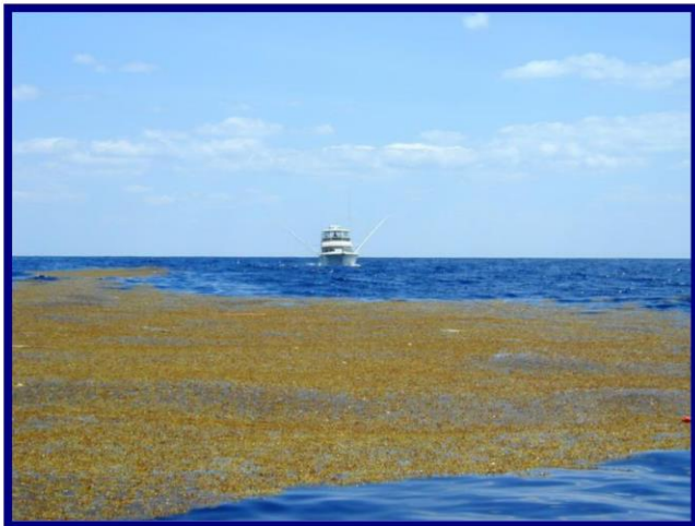
The 2006 CSS Dolphin Study will begin to explore the relationship of dolphinfish and Sargassum.

Major support for the study has also been received from Sport Fishing Magazine and World Publications. This nationally renowned saltwater magazine has provided solid support for the study over the last four years, publishing a major article along with news updates on the study's progress to keep fishermen informed. As a sponsor, Sport Fishing will provide an invaluable service by alerting new anglers to the importance of the research effort and keeping anglers abreast of the study's findings. The Dolphin Study newsletter will be published in four