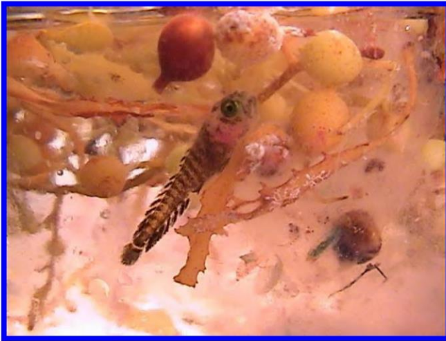
Larval and early juvenile dolphin have been shown to be highly susceptible to the toxins present in crude oil, suggesting that all dolphin young spawned in an affected area could be killed.

NOAA researchers are working to determine at what level does PAH begin to affect larval fish. This information will not cure or prevent future damage. At best, it will only allow a better prediction of the damage. No one knows how long these contaminants will continue to kill larval fish and whether lethal levels of these toxins will be spread to other areas by the ocean's currents. Such toxins in our oceans are silent, invisible killers that will continue to have a deadly effect on larval fish for years to come. We could be left to wonder what happened to the dolphin and never know what caused their decline.